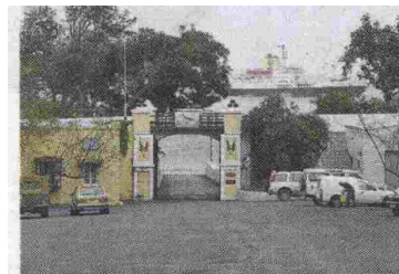
In the background is the RMS ship which is the only means of communication between St Helena and the rest of the world.