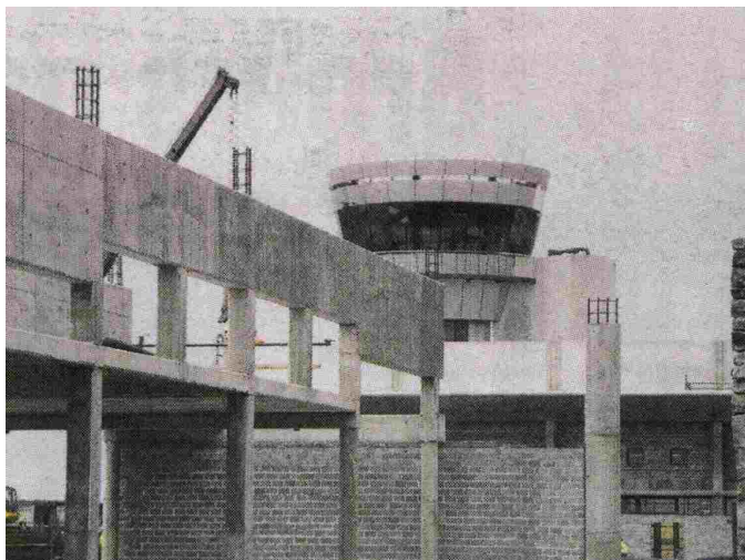
The airport buildings that are being constructed on the Island.

Get the latest updates on the project at: http://www.brshap.co.za/